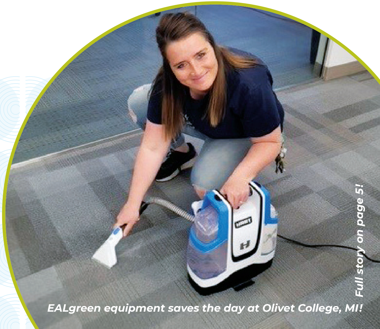
EALgreen equipment saves the day at Olivet College, MI!