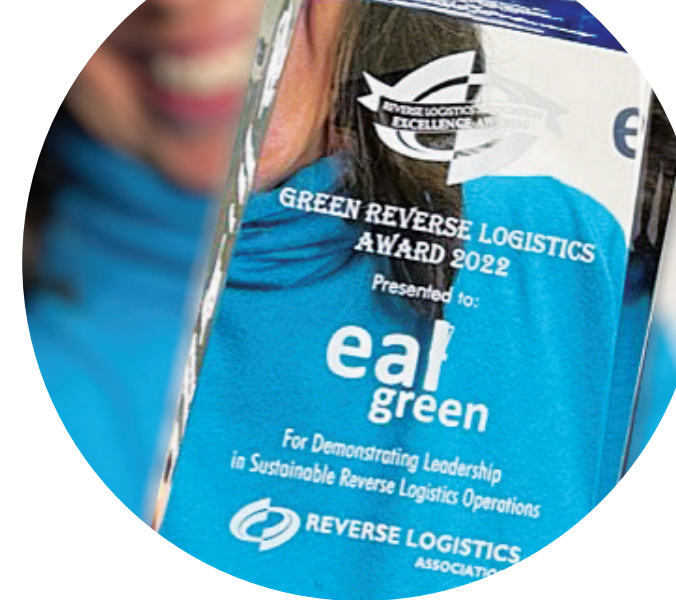
Green Reverse Logistics Award, 2022

Unique. Ambitious. Valued. Those two original motors and the $5,000 for one student pioneered a model transforming tools to HVAC units into more than $30MM in financial assistance for the 21,073 students at nearly 100 campuses whose college careers were, in part, assisted by EALgreen.