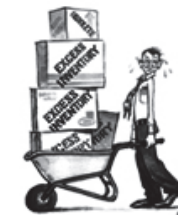
Early EAL told its story through a mascot; his name was Elroy.