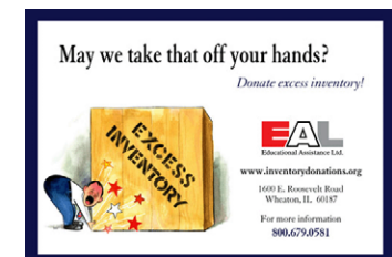
Advertising in airline magazines brought many inquiries to EAL's; some of those donors remain active today.